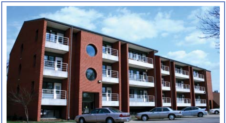
Fair Haven East

Going forward, we are working with WesleyLife to help insure and smooth transition over the next few months for both the employees and residents of Jefferson Place, Pella Manor and Fair Haven East.